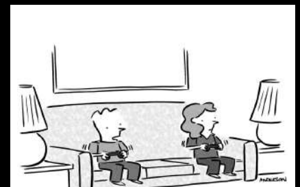
"It's interesting - Mom hates early Christmas sales, but she loves early back-to-school sales."